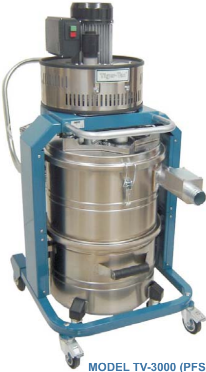
MODEL TV-3000 (PFS)