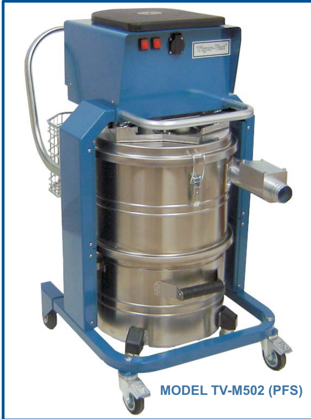
MODEL TV-M502 (PFS)