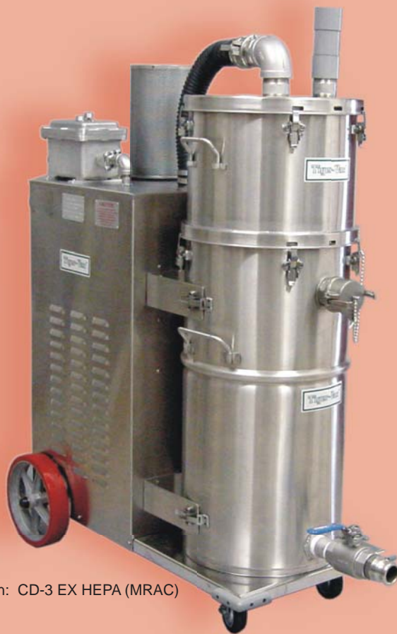
Illustration: CD-3 EX HEPA (MRAC)

EXPLOSION PROOF / DUST IGNITION PROOF ELECTRICALLY OPERATED VACUUM CLEANER SYSTEMS FOR EXPLOSIVE AND CONDUCTIVE DUSTS MODELS CD-3 EX HEPA (MRAC) and CD-3 EX HEPA (WD)