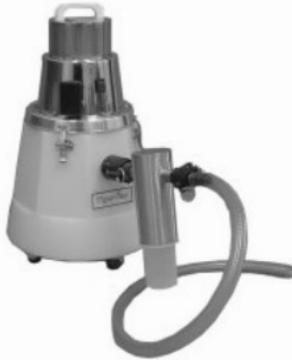
MRV-8 CR Poly (Clean Room Version) (P/N 110115)