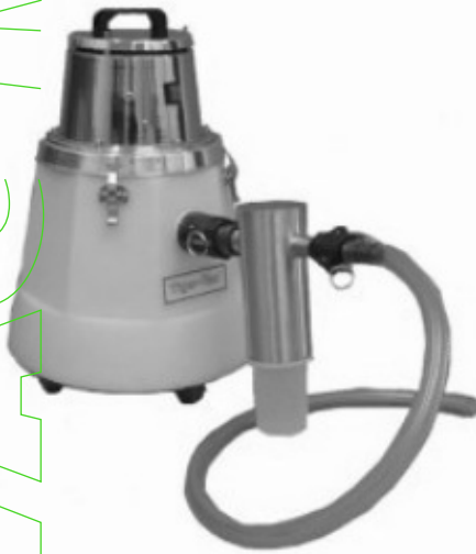
MRV-8 Poly (P/N 110116)