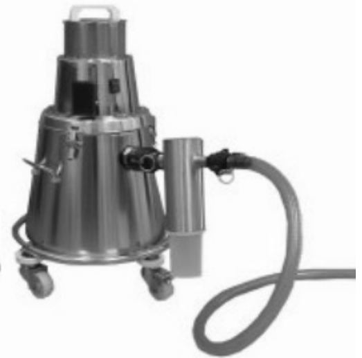
MRV-8 CR S/S (Clean Room Version) (P/N 110118)